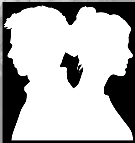
This could be you! Trustee Term Expires 2026